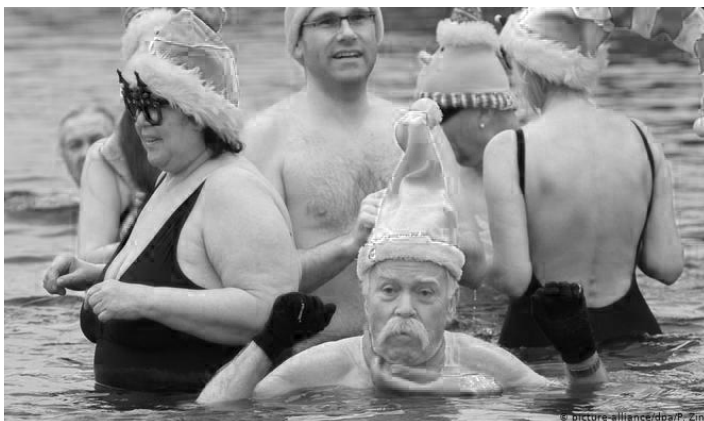
Some groups' hobbies are more refreshing than others: The "Berlin Seals" dip in lakes all winter

Germany's largest association is ADAC ("Allgemeiner Deutscher Automobil-Club e.V.," or the German Automobile Club), with over 20 million members. Europe's largest association of hackers is also a German Verein: the "Chaos Computer Club e.V." was founded in West Berlin in 1981. If hacking is not your thing, Germany has a variety of unusual associations to choose from, as our picture gallery shows.