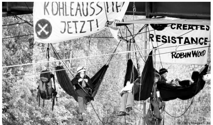
Robin Wood, founded in 1982, is a German environmental advocacy group that stages attention-grabbing stunts

Your first impression of a Verein will vary greatly depending on the first one you meet. Highly traditional ones in-