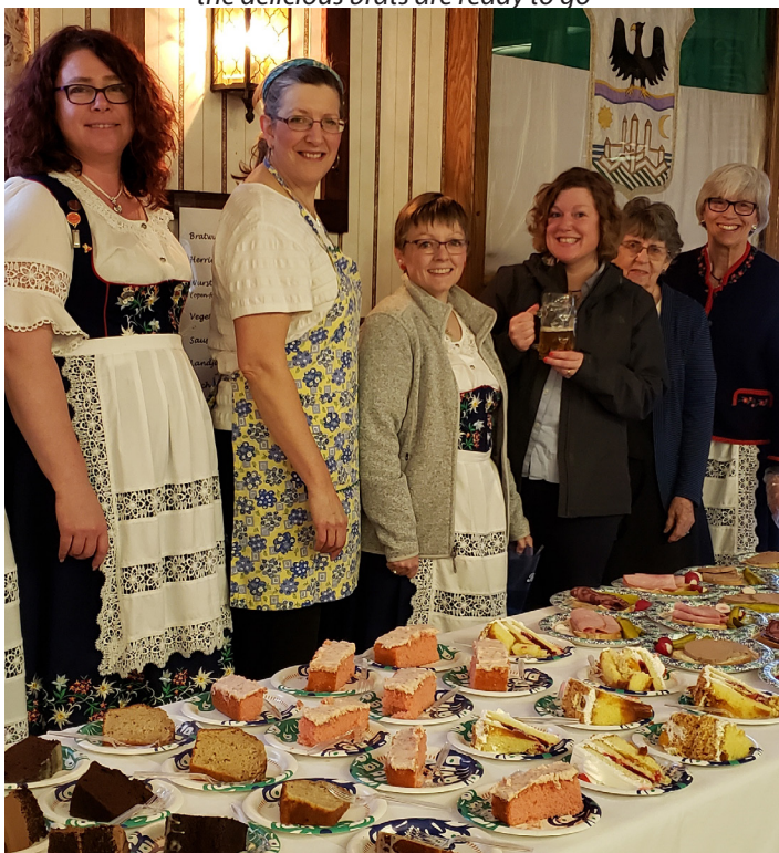
Some of the hard working DANK ladies who helped make the night a success