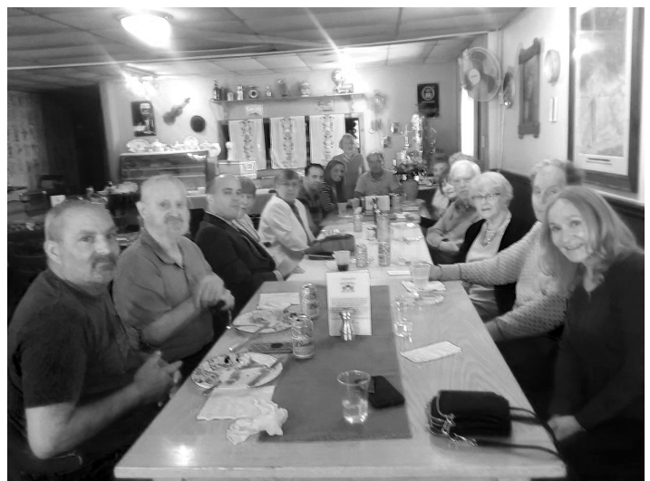
Our DANK Gruppe