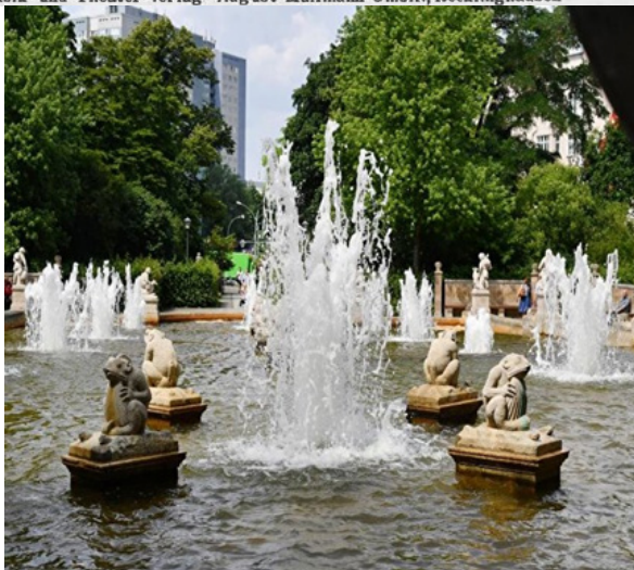
Märchenbrunnen, Berlin – Fairytale fountain

Wenn alle Brunnlein fließen, So muß man trinken Wenn ich mein Schatz nicht rufen darf, Tu ich ihm winken, Wenn ich mein Schatz nicht rufen darf, Ju, ja, rufen darf, Tu ich ihm winken. Ja, winken mit den Äugelein, Und treten auf den Fuß; 's ist eine in der Stube drin, Die meine werden muß, 's ist eine in der Stube drin, Ju, ja, Stube drin, Die meine werden muß, Warum sollt sie's nit werden, Ich hab' sie ja so gern; Sie hat zwei blaue Äugelein, Die leuchten wie zwei Stern, Sie hat zwei blaue Äugelein, Ju, ja, Äugelein, Die leuchten wie zwei Stern. Sie hat zwei rote Wängelein, Sind röter als der Wein; Ein solches Mädlein find'st du nicht Wohl unter'm Sonnenschein; Ein solches Mädlein find'st du nicht, Ju, ja, find'st du nicht, Wohl unter'm Sonnenschein.