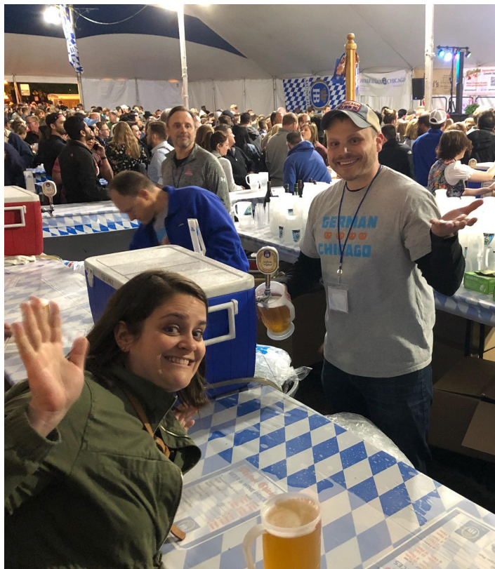
Volunteers at the DANK Haus