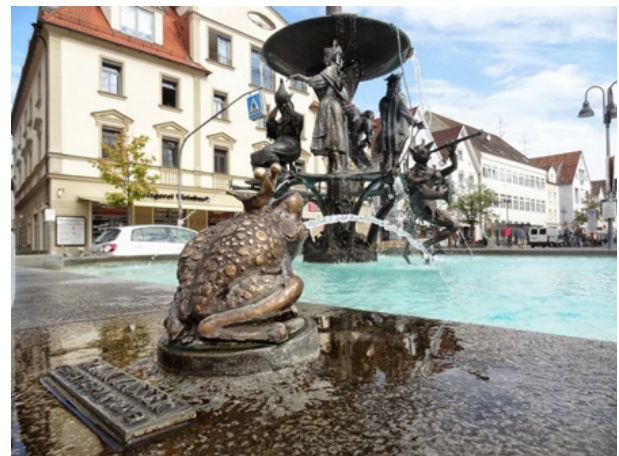
Trinkwasserbrunnen in Ehlingen - Schwaben

Region: Pommern, Schleswig Holstein und Schwabenland